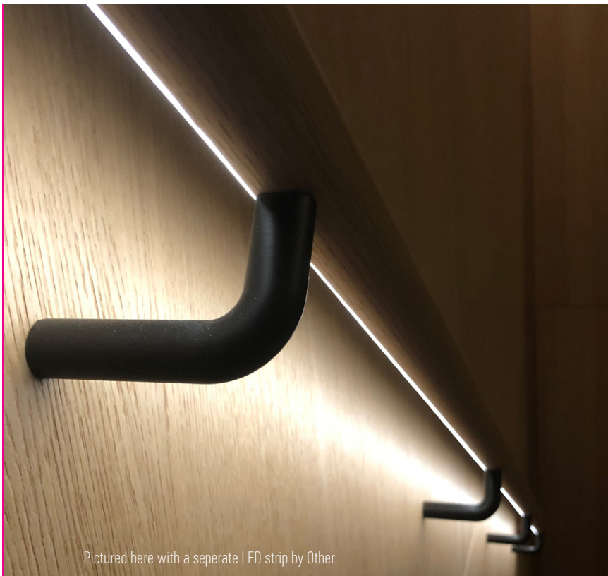
Pictured here with a separate LED strip by Other.

EBA : Electro Black Ace EFW : Electro Flat White EDB : Electro Dark Bronze ENS : Electro Natural Silver EMB : Electro Medium Bronze WHT : Appliance White