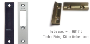
dustbox and strike plate

To be used with HB1410 Timber Fixing Kit on timber doors