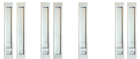
Snib/Indicator HB 1490 configuration

To be used with HB1410 Timber Fixing Kit on timber doors