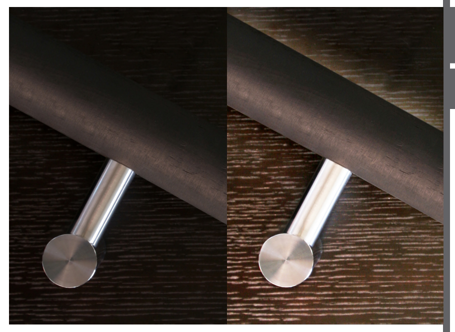
HB 528 HB 526