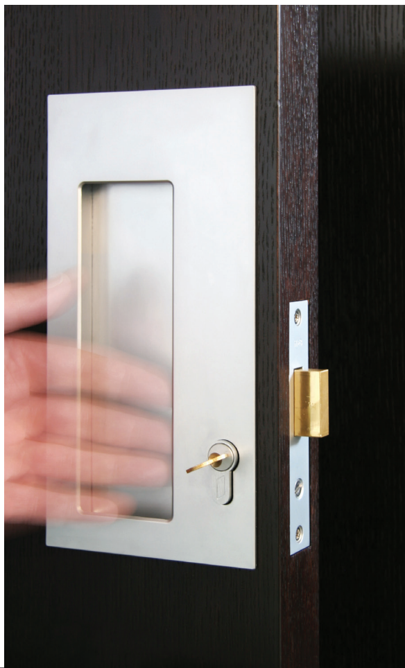
left hand flush pull shown

Available in all standard Halliday + Baillie finishes, see finishes sheet for further details.