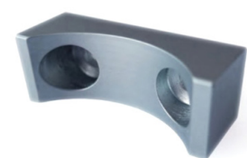
Centerline of magnet and keeper : 34mm

Designed and manufactured in New Zealand. For more information, installation templates, and measured drawings of this product and others please visit : www.hallidaybaillie.com or contact your authorized Halliday + Baillie dealer. All information subject to change.