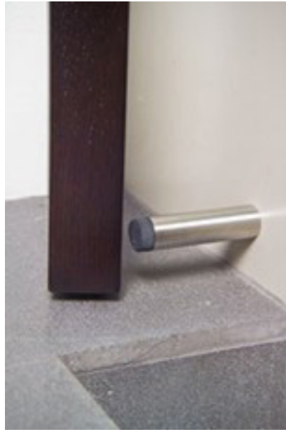
shown in EMB