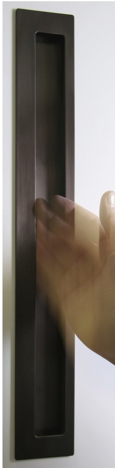
Right Hand Pull

To be used with HB1510 Timber Fixing Kit on timber doors, sold separately.