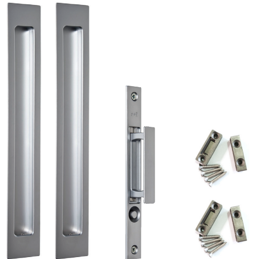
HB 680 PUSH BUTTON EDGE PULL

To be used with the HB 604 Timber Fixing Kit on timber doors.