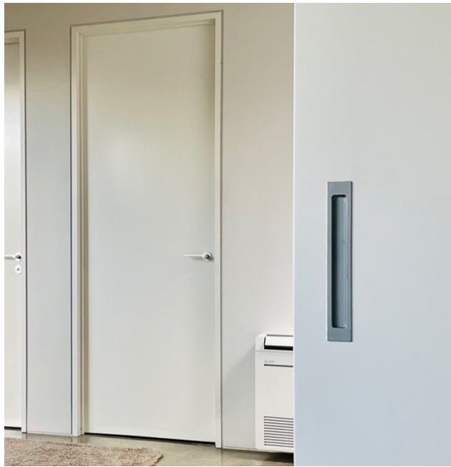
HB 665 Flush Pull