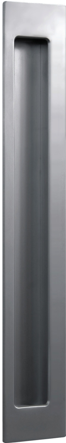
Left Hand Pull shown, also available Right Handed

Available in all standard Halliday + Baillie finishes. See finishes sheet for further details.