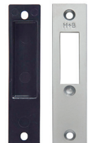
dustbox and strike plate