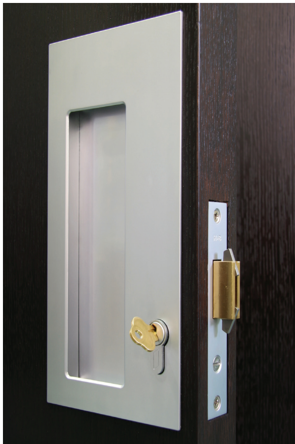
left hand pull shown