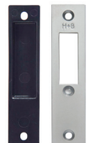
dustbox and strike plate

Designed and manufactured in New Zealand. For more information on this product and others please visit www.hallidaybaillie.com . For dealers in North America, contact Bridgeport Worldwide +1-800-362-1484 www.BridgeportWorldwide.com/hallidaybaillie . All information subject to change.