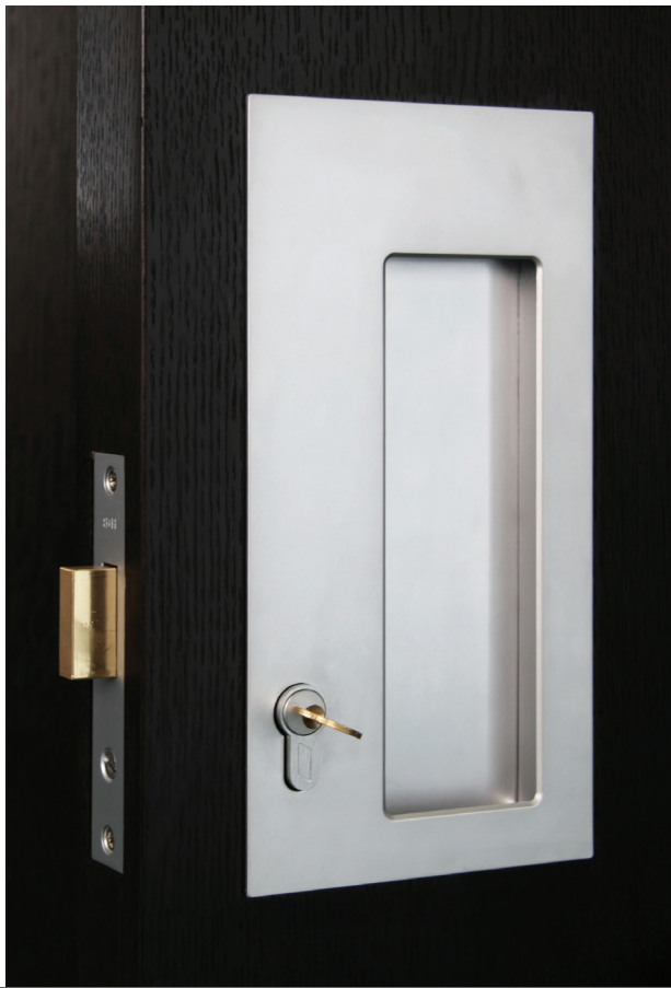
right hand pull shown

Available in all standard Halliday + Baillie finishes, see finishes sheet for further details.