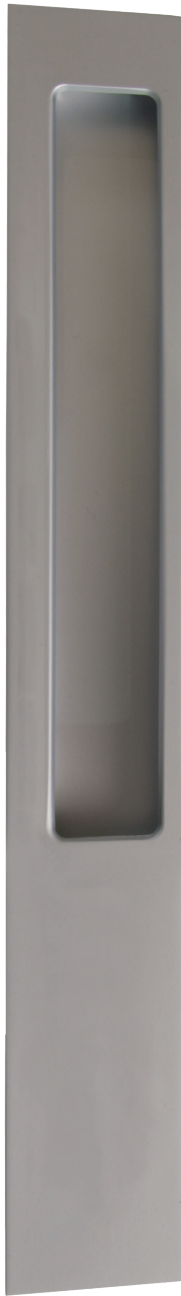
right hand pull shown

Suitable for large timber or aluminum doors. Available in all standard Halliday + Baillie finishes. See finishes sheet for further details.