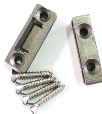
HB 604 Timber Fixing Kit on timber doors