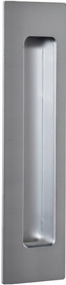
Right Hand Pull showing, also available Left Handed

Available in all standard Halliday + Baillie finishes. Please check with your H+B representative as not all finishes are available in all regions. See finishes sheet for further details.