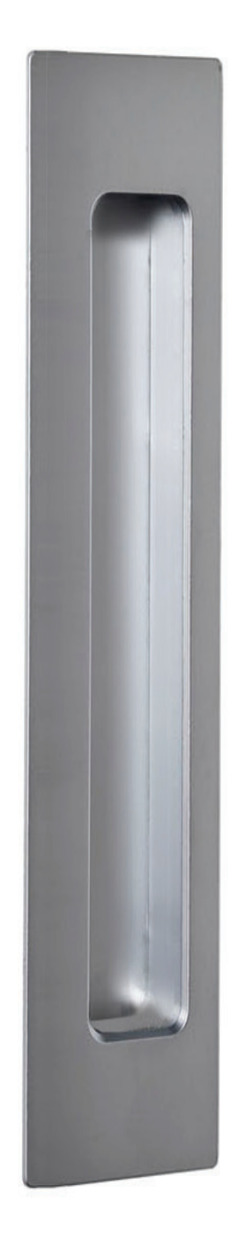
Right Hand Pull showing, also available Left Handed

To be used with the HB 604 Timber Fixing Kit on timber doors