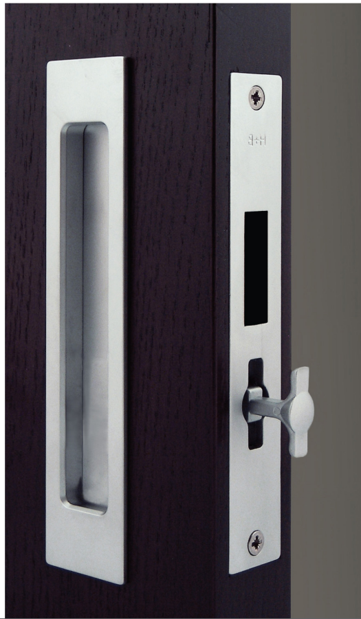
Shown with HB 660 Flush Pull (ordered seperately)

Available in all standard Halliday + Baillie finishes, see finishes sheet for further details.