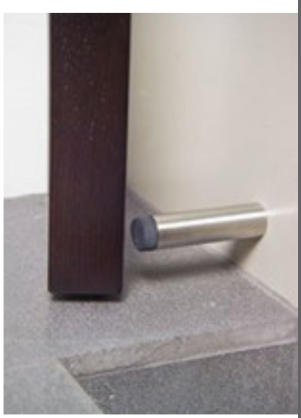
shown in EMB