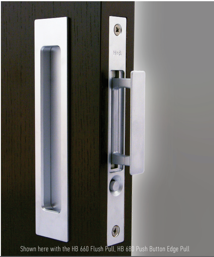
Shown here with the HB 660 Flush Pull, HB 680 Push Button Edge Pull