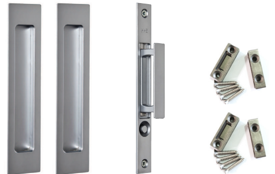
To be used with the HB 604 Timber Fixing Kit on timber doors.

Designed and manufactured in New Zealand. For more information on this product and others please visit www.hallidaybaillie.com . For dealers in North America, contact Bridgeport Worldwide +1-800-362-1484 www.BridgeportWorldwide.com/hallidaybaillie . All information subject to change.