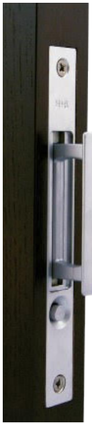
HB 680 Push Button Edge Pull