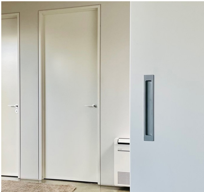
HB 665 Flush Pull