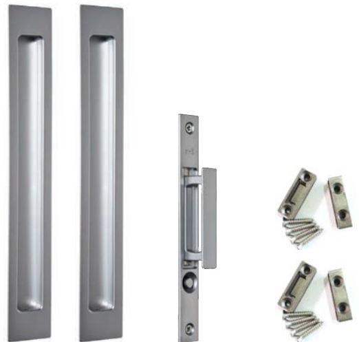
HB 680 PUSH BUTTON EDGE PULL

To be used with the HB 604 Timber Fixing Kit on timber doors.