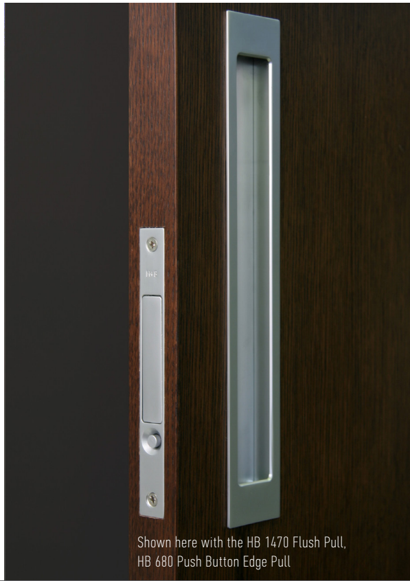
Shown here with the HB 1470 Flush Pull, HB 680 Push Button Edge Pull

To be used with the HB 1410 Timber Fixing Kit on timber doors.